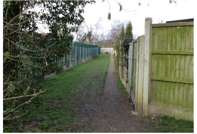
Left turn after playing field.