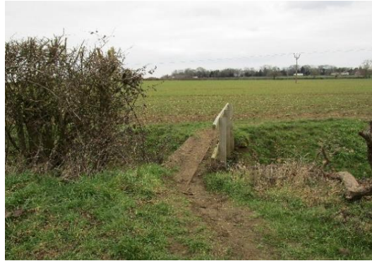
Footbridge after 2 nd field