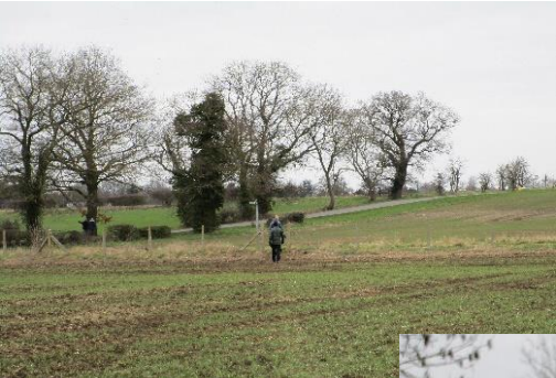
Turn left after joining road