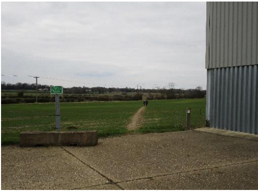
Follow the arrows across this field