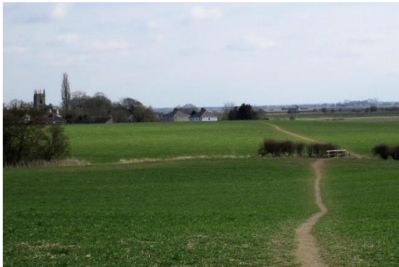
Cross the fields, via the footbridge