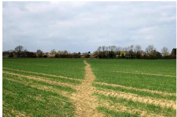
Cross the fields towards end of hedge