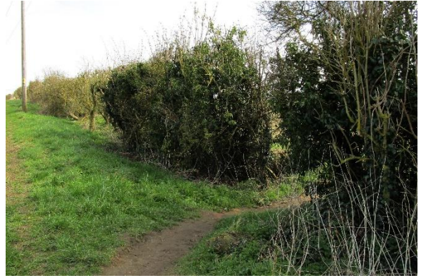
First gap in hedge