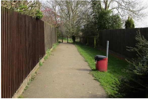
Footpath off Lady Meers Rd