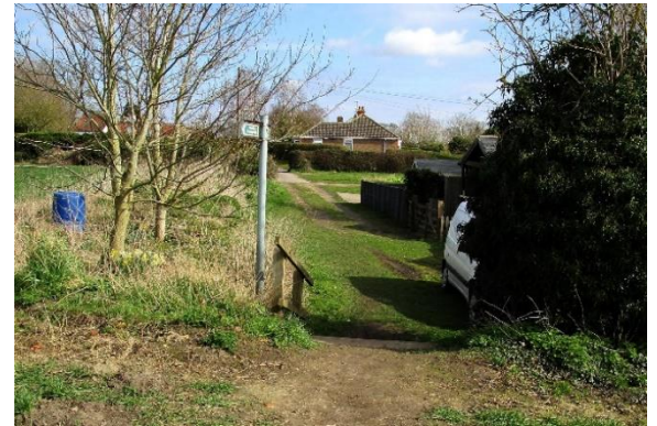
Steps down to rear of houses.