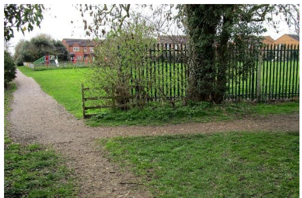
Keep left here towards play area.