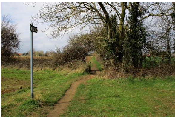
Signpost over footbridge