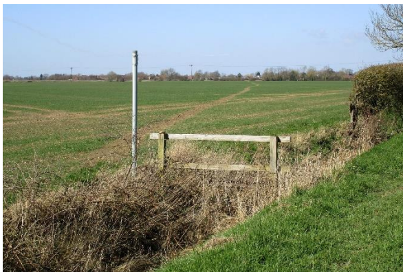
Footbridge off Reepham Road